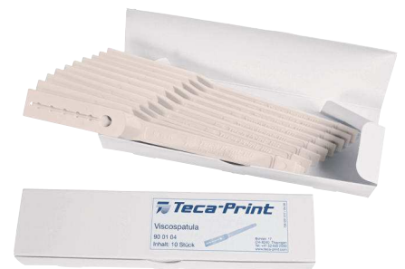
Package with 10 Viscospatulas article no. 90 01 04

If the handling properties are particularly good, write down the flow time. Then the next time you work with the same ink you can repeat the adjustments to get the ideal value.